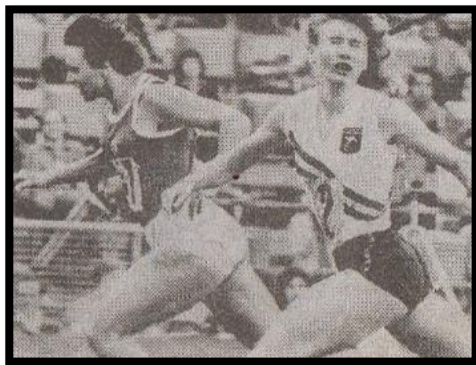
Raelene Boyle applying her total strength attempting to win the 200 m at Munich. Only to be beaten by a drug cheat from East Germany.

‘Bursting with pain is the wrong way to say it, but I felt like I was going to explode with pain. I was chasing her down and was getting so close, I was straining everything I had. I was coming through and she was coming back and it was tight, there was a few hundredths of a second in it.’